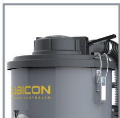
Jet pulse filter cleaning